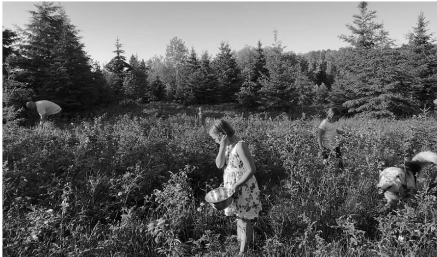
Black River Foraging Company (top); Installing solar panels (bottom)

The farm space was designed in partnership with Northbound Bloom: a permaculture design firm that will use the space to demonstrate green building techniques and permaculture design.