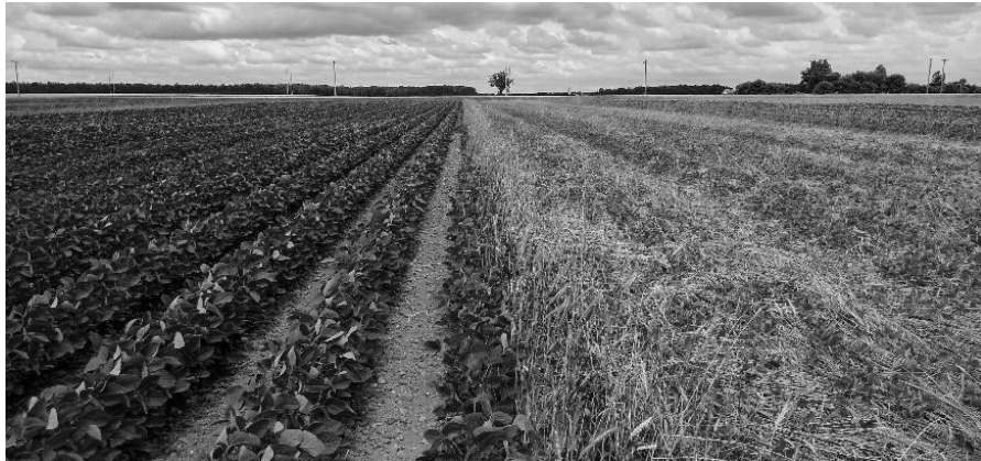
Figure 1. Traditional tillage-based, 30-inch row soybeans (left) compared with no-till soybeans drilled at 7.5-inch spacing, growing through cereal rye mulch (right) at an on-farm site near Drayton, Ontario. July 22, 2019

The field toured on July 24th, managed by the Van De Walles who are in Ecological Farming in Ontario