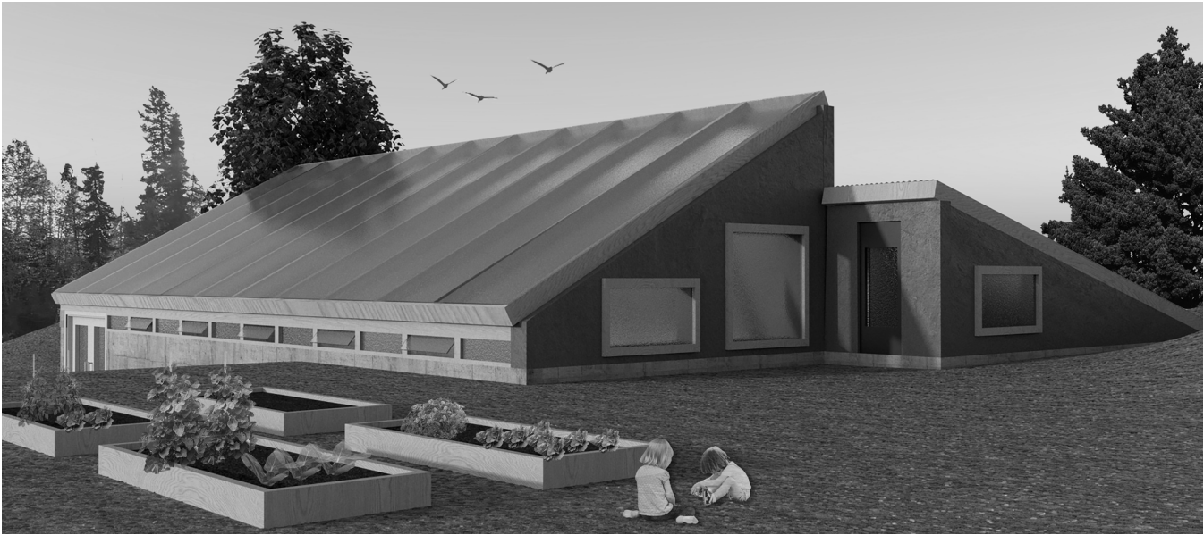
3D rendering of greenhouse (top); site preparation (bottom)