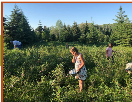
Black River Co-operative