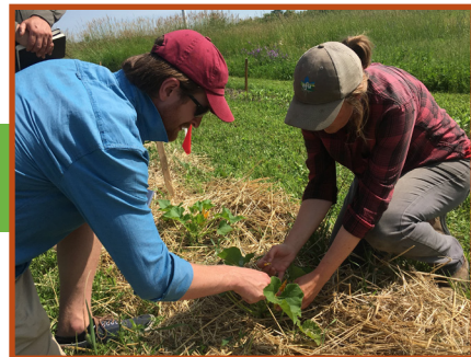
Seed Saving Workshop