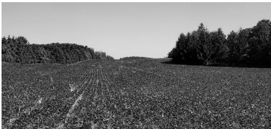
Figure 3. An on-farm project site near New Hamburg with low rye biomass with weeds coming through the mulch. Soybeans were drilled at 15-inch spacing and had a final stand of 148,000 plants/acre. July 24, 2019.

To learn more about the project, visit the cover crops page of fieldcropnews.com and EFAO's Farmer-Led Research page this winter, or look for the OSCIA Crop Advances report online at the end of the year. 🍀