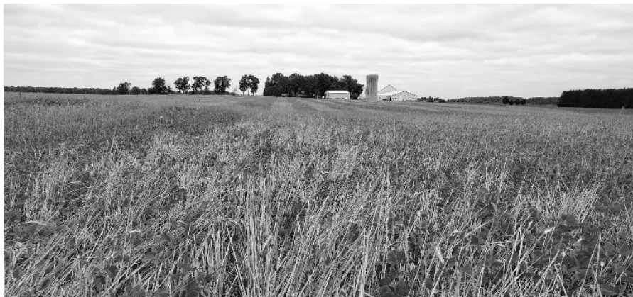
Figure 2. Organic no-till soybeans growing up through cereal rye mulch. St. Marys, Ontario. July 12, 2019

their third year raising no-till organic soybeans, is in the best shape of all six in the project ( Figure 2 ). The rye was seeded last September after sweet corn harvest and developed a thick stand this spring. The Van De Walles crimped and seeded soybeans on June 8th. Although they have used a modified planter in the past, this year they opted for a John Deere no-till drill and a heavier soybean seeding rate than normal (350-400,000 seeds/acre). Regular rainfall following seeding was essential, as seed slots did not close well across most sites. Slow early-season growth is typical in this system, as seen in Figure 2, but later season growth can be rapid.