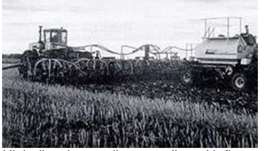
High disturbance direct seeding with flattened stubble.