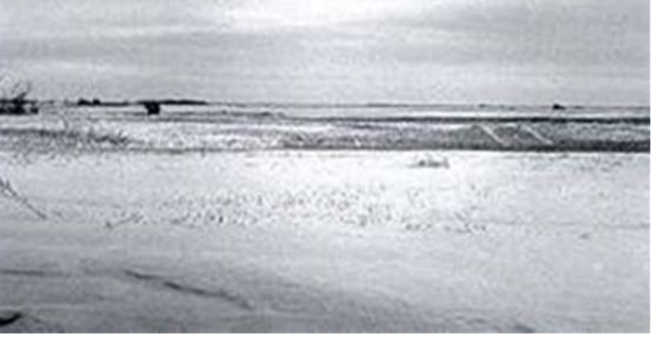
Undisturbed stubble, six to nine inches tall left standing over winter to trap snow on the field, can result in one-half to one inch more water than stubble that was cultivated in the fall.

In a moisture-limited environment such as Saskatchewan, crops generally use all the available water in the root zone. Therefore, basic crop rotation decisions must consider spring soil moisture level and anticipated growing season rainfall.