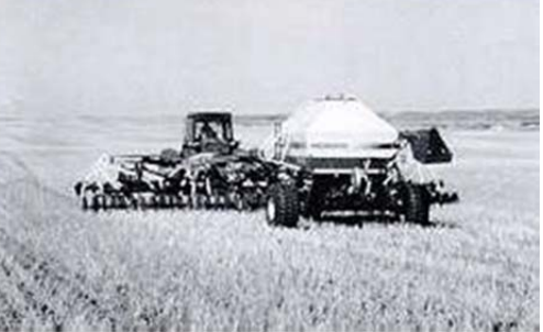
Low disturbance direct seeding or zero till with standing stubble.

With low disturbance direct seeding (zero tillage) the stubble is also left standing after the crop is seeded. This reduces moisture loss from soil and plants until the crop canopy has developed. This also increases crop yield.